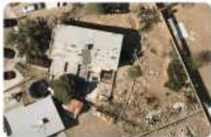
Example: Roof Damage