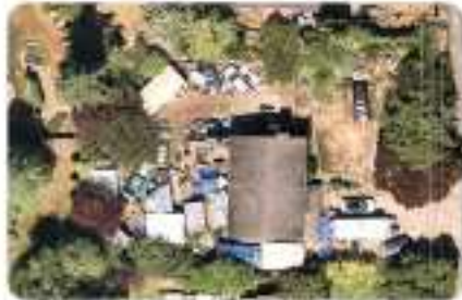
Example: Lot Debris