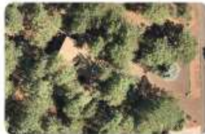
Example: Overgrown Vegetation