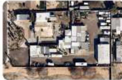
Example: Business Activities