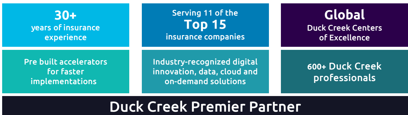
Figure 3. Capgemini differentiators