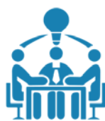
SMALL BUSINESS TEAM